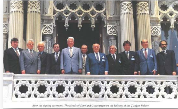
After the signing ceremony. The Heads of State and Government on the balcony of the Çırağan Palace