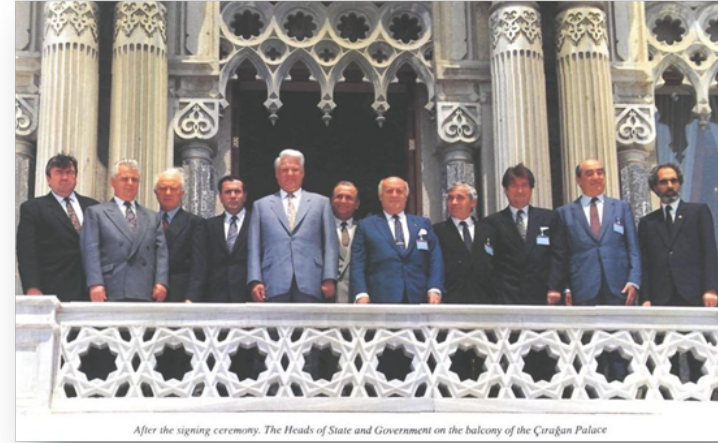
After the signing ceremony. The Heads of State and Government on the balcony of the Çırağan Palace